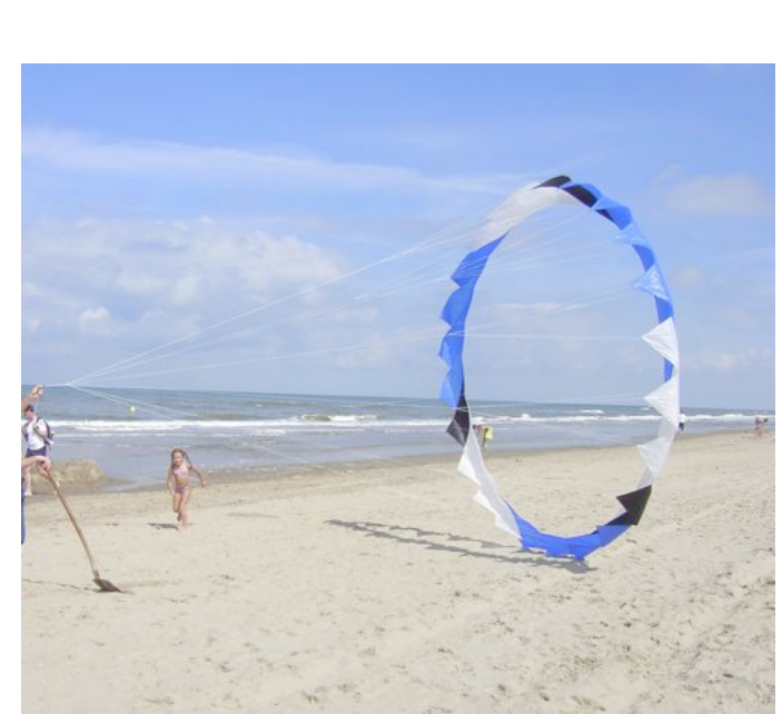
3.6 inner diameter held by hand

Sew these together as shown on the drawing above. Make sure to use a double straight stitch or a zigzag. When the used fabric is strong enough no tabs are needed.